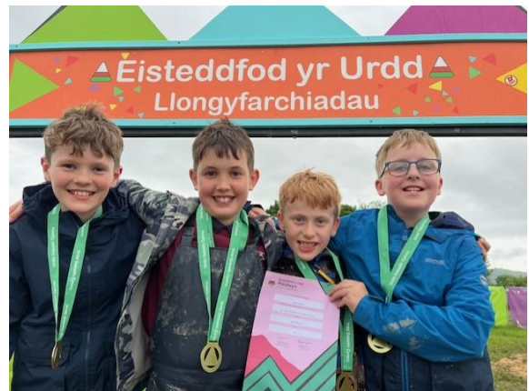
Winners Yr 6 and under website National Eisteddfod Maldwyn 2024