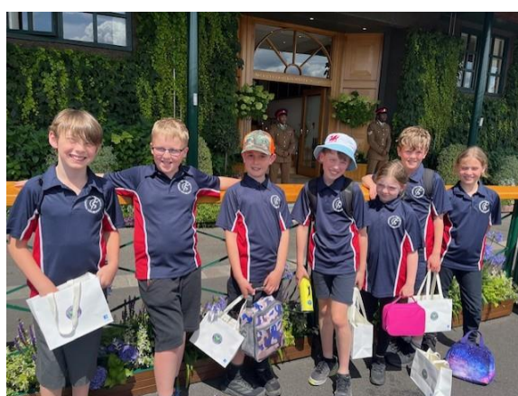
School visit to Wimbledon 2024