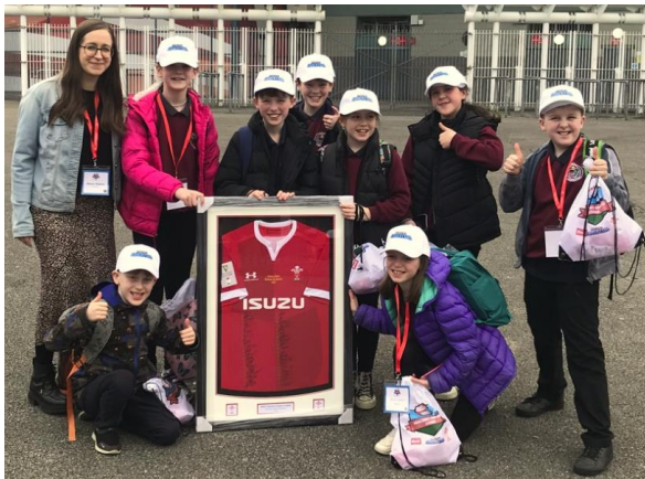
National Winners E-Sports Wales 2024

Pupils had remarkable success in 2024, winning two national competitions in Minecraft and website design.