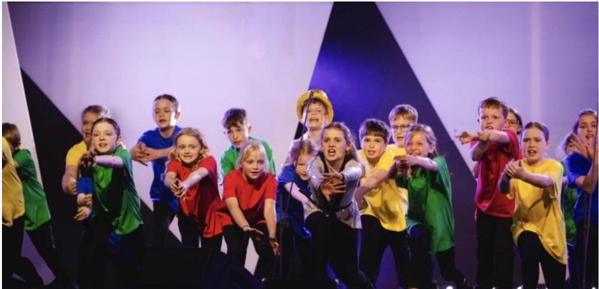
Pupils performing in the show Crib, Siswrn a Rasel at The Maldwyn National Eisteddfod 2024.